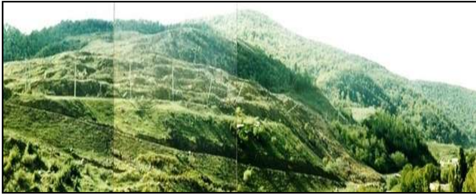
Fig. 1. General view of the Haghartsin landslide site.