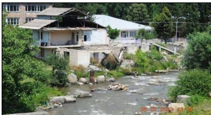
Fig. 5. Destroyed buildings on the left bank of the Aghstev river (05.07.2013).

Ministry of Emergency Situations of the republic. The houses of the residents of the village of Haghartsin are destroyed as a result of constant flooding (see Fig. 5).