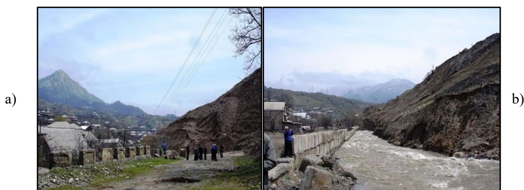
Fig. 4. A bypass road blocked by a landslide - a); landslide masses that collapsed into the riverbed of the Aghstev river - b).

New landslide movements with riverbed closure occurred on May 27, 2005 and April 28, 2006. At the same time, the lower floors of more than 20 houses with their homesteads, a rural school (in its northern building, the height of the water level was 1.2 m) were flooded. After 2006, almost every year in the spring, landslide masses block the riverbed, creating a lot of problems not only for the villagers, but also for the