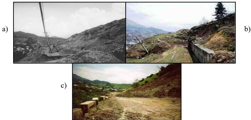
Fig. 2. The railway destroyed by a landslide - a); blocked by climb down masses the railway track - b); the bypass road - c).

The Haghartsin landslide as a whole, according to the mechanism of manifestation, refers to a block shift landslide, and its eastern part (the eastern block) with its characteristic hydrogeological regime and obvious signs of suffusion phenomena refers to a viscoplastic landslide with suffusion removal. The landslide site covers an area of 82,000 m 2 , its length is 270 m, width is 300 m, the volume of the landslide mass is 2,184,000 m 3 . Within this landslide, three blocks are allocated with the following parameters (see Table and Fig. 3).