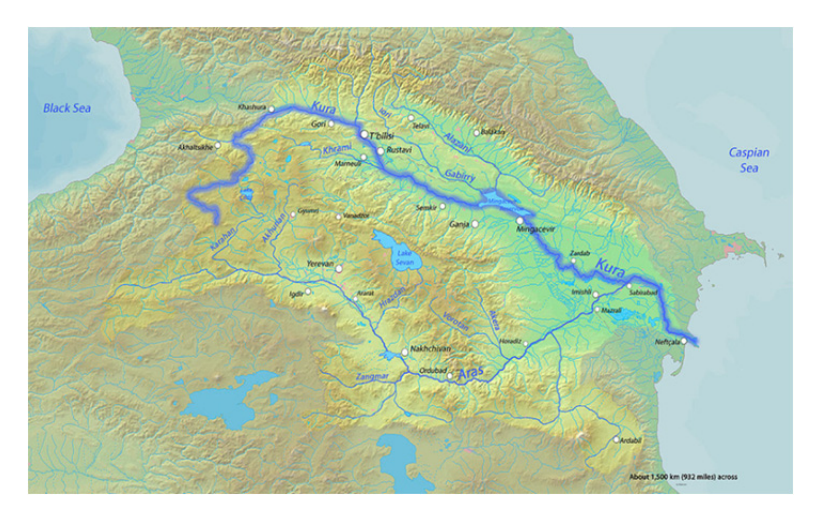
Fig.1. River Mtkvari basin.

The river is now moderately polluted by major industrial centers like Tbilisi and Rustavi and it is now much slower and shallower, as its power has been harnessed by hydroelectric power stations in Georgia.