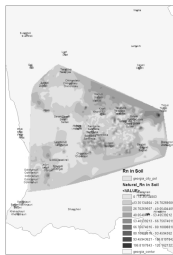
Fig. 1 Radon distribution in soil

The Northern and Central parts of the tested area belongs from the geological point of view to the Kutaisi sub-zone of the Georgian plate and its Southern part – to the Adjara-Trialeti folded system. The North-East part of the first zone (villages Rioni and Gurna) is composed mostly by Jurassic volcanic rocks, which contain fissure groundwater of low mineralization (hydrocarbonate and calcium type). From the morphological point of view here we have glacial-erosion terrain that is characteristic for this mountainous area. In this area to the north of Kutaisi we found a band of elevated radon content in the soil (22-26 KBq/m 3 ), which should be related to the presence of dikes of the crystalline rocks and systems of faults, developed on this territory. At the same time the content of radon in the water is low, which can be explained by influence of near surface groundwater circulation in this zone.