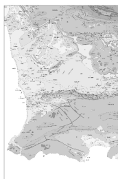
Fig. 2 Geological map

To the South on the surface there are Lower Cretaceous rocks, which contain fissure and fissure-karstic type of pressurized ground water (regions of Tskaltubo and Kutaisi); the characteristic example is the low-radioactive thermal waters of Tskaltubo resort. Here the springs have large debit (200-220 l/s). The recharge of the aquifer takes place in the northern elevated areas; then the aquifer plunge under the Quarternary layers and its